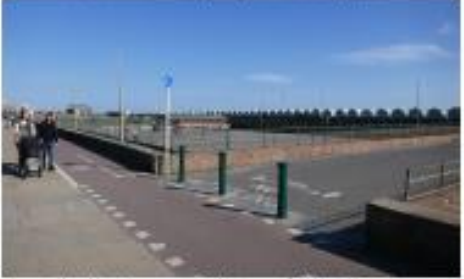
Inacressible public resirs spaces at Park entracess (MIGA and Tennis)