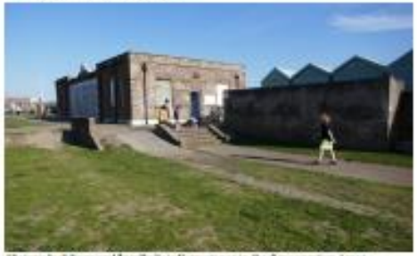
atoric buildings and locally listed structures in the Conservation Areas