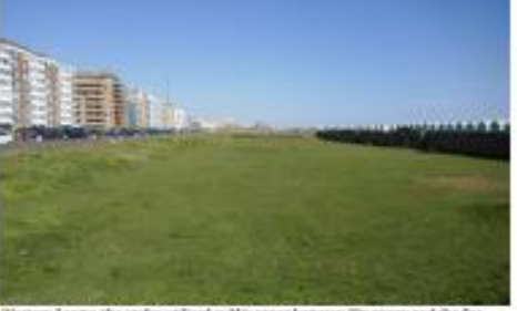
Nestern Lewis, the under-utilised public space between Kingsway and the Sea