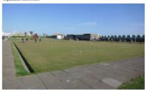
Existing sports areas (Croquet lawn)