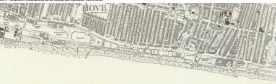
1932 - The Lagron completes the urbanguation of the weathout